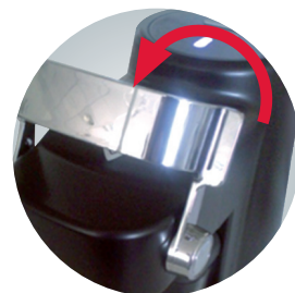
1 - Raise handle no. 2