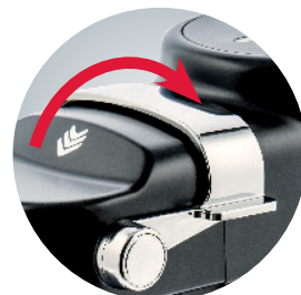
3 - Lower handle no. 2