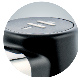
4 - Select small coffee/ large coffee